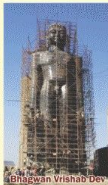
Bhagvan Vrishabh Dev

The City Malegaon is surrounded by many holy places like Shirdi, Mangitungi, Saptashringi, Chandanpuri and Trimbakeshwar. Shirdi is the famous worship place of Saibaba popularly known as SHIRDI is 90 Km from the city Malegaon. Mangi Tungi is situated about 125 Km from Nashik, This place is very well known for the highest Digamber Jain idol of Bhagvan Vrishabhdev in the world is carved in mountain hill. Saptashringi (seven peaks), about 100 km from Malegaon, is one of the hill stations in Maharashtra, where an idol of Goddess Saptashringi is carved in the wall on the hill. Chandanpuri, 10 km from here is one of the famous places in the life story of God Malhar and his wife Mhalsa is worshiped by all Hindus.